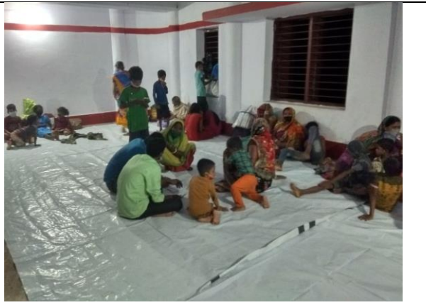
View of cyclone shelter in Jamboo village of Kendrapara, Odisha