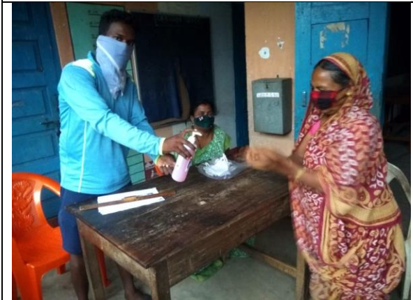
Covid19 appropriate behaviour like mask wearing and hand sanitization while entering cyclone shelter in Jamboo village of Kendrapara, Odisha