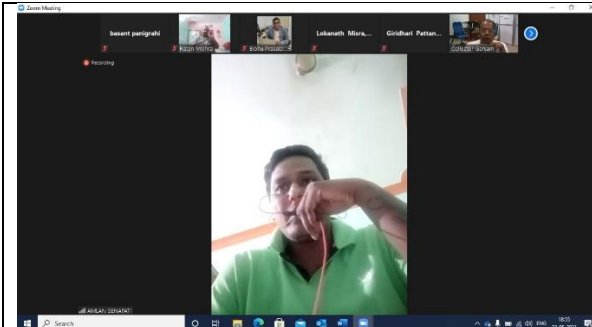
Distirct level GO- NGO coordination meeting