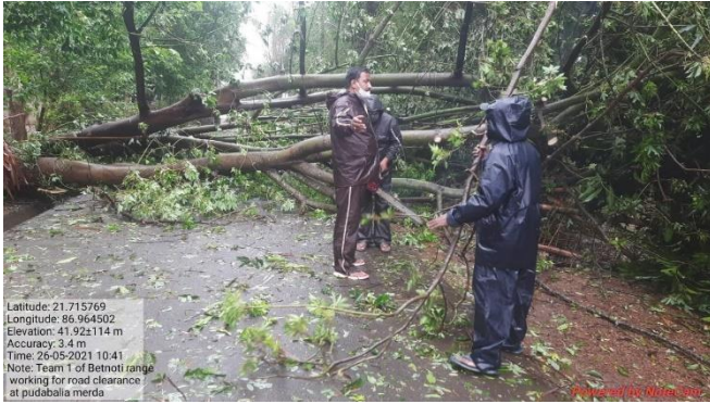
CMO twitter handle