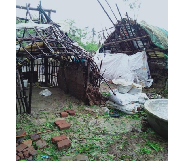
Kutchha houses damaged in Rajnagar block of Kendrapara, Odisha